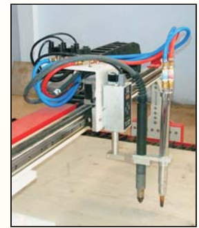
Auto Torch Height Controller